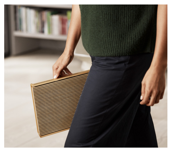
When you move Beosound Level, it will automatically detect its new orientation and provide optimal sound experience for any placement.