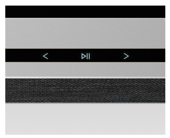
The light indicator shows the status of the product.